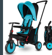
smarTrike Stroller: Foldable but not easy to carry