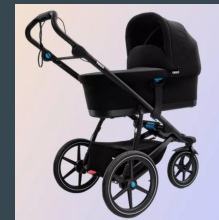
Thule Urban Glide: Easily maneuverable but heavy and not easy to fold