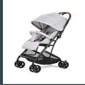
Welspo Foldable Stroller: Light and easily foldable, but multiple safety concerns.