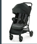
Graco NimbleLite Stroller: Light and foldable but slightly flimsy